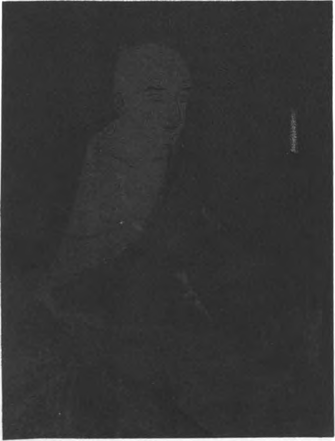
The Indian Story-Teller at Nightfall.